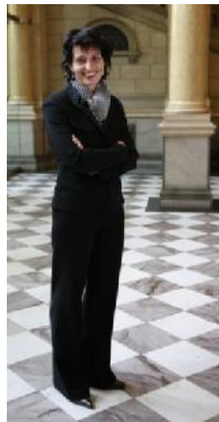
H.E. Federal Councillor Doris Leuthard

For more information visit www.eulerhermes.ch