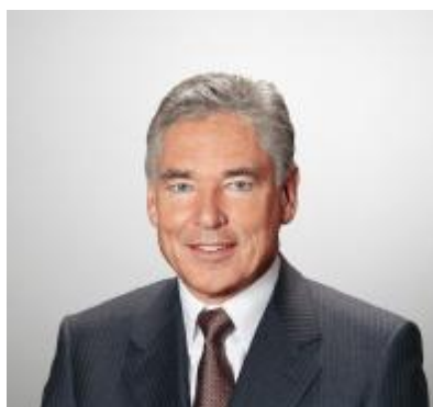
Peter Brabeck-Letmathe Chairman of the Board, Nestlé S.A.

Peter Brabeck-Letmathe led the Nestlé Group from 1997 to 2008, first as CEO, till 2005, and then as Chairman and CEO. In April 2008, he handed over the office of CEO and is now Chairman of Nestlé S.A.