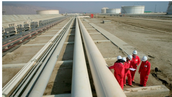
On the South Caucasus Pipeline, a piece of the Southern Gas Corridor.