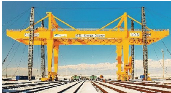
Khorgos Gateway on the China-Kazakh border.