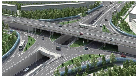
A rendering of the highway that will connect Tajikistan and Uzbekistan.