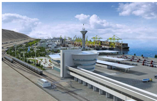
Turkmenbashi International Seaport, inaugurated in May 2018, offers access to the Caspian Sea for other Central Asian countries. It is poised to be a new logistics hub between East and West.