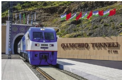
Qamchiq Tunnel in Uzbekistan, the longest railway tunnel in Central Asia, was built by the China Railway Tunnel Group. The Uzbek-Chinese project will reduce regional transportation costs and boost trade.