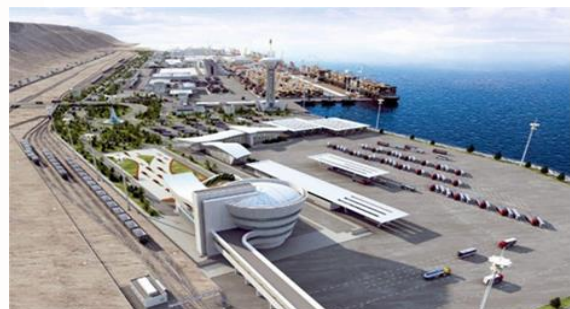
Turkmenbashi International Port on the Caspian Sea.