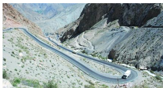
Dushanbe-Chanak Highway, Tajikistan built by the China Road and Bridge Corporation (CRBC).